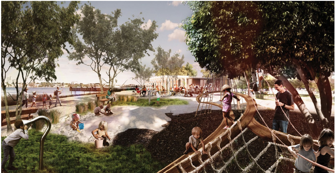
Artist's impression Riverside Precinct