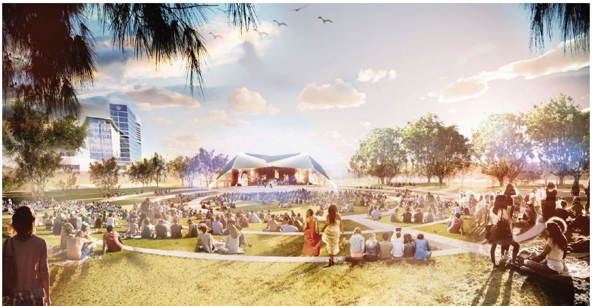
Artist's impression Festival Precinct