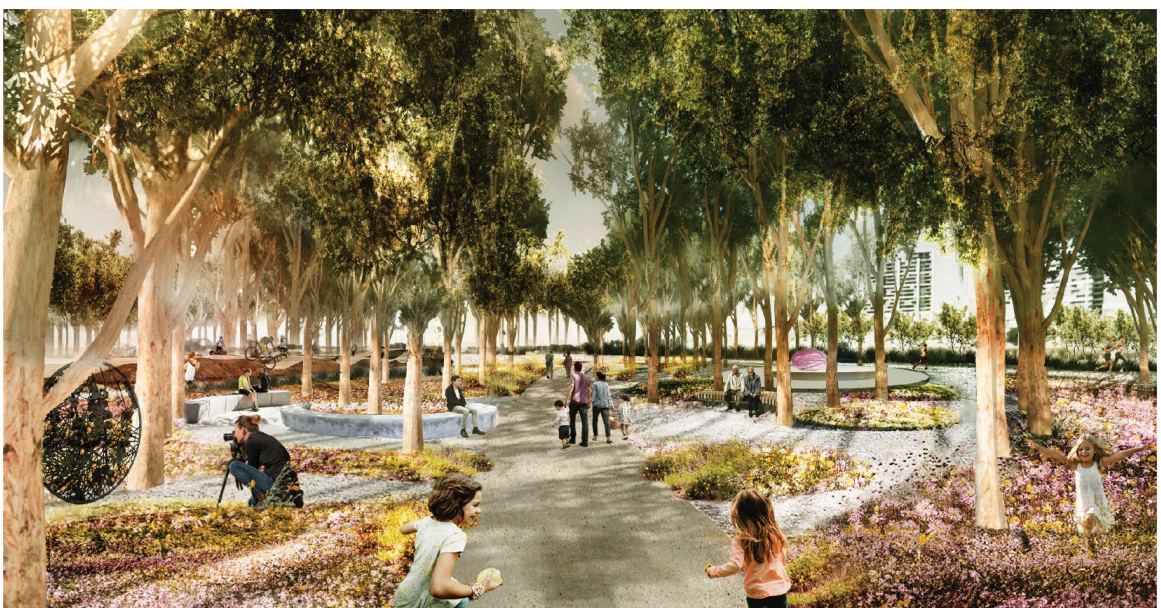
Artist's impression Forest Precinct