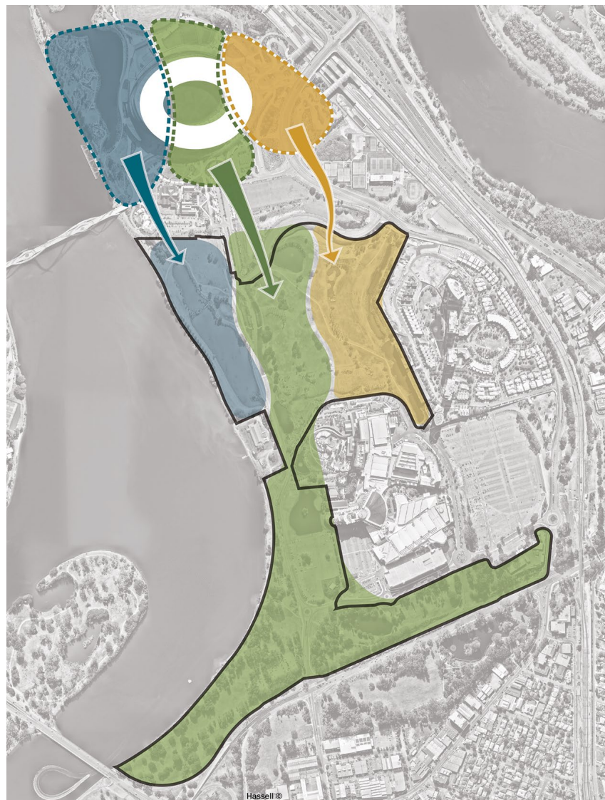
The three precincts

The three landscape precincts already exist within and around Optus Stadium and will be carried through to Burswood Park for a seamless Burswood Peninsula experience.